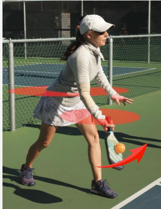
Figure 4-3 (legal serve)