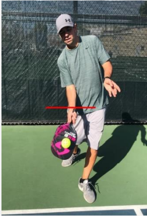
Figure 4-1 (legal serve)